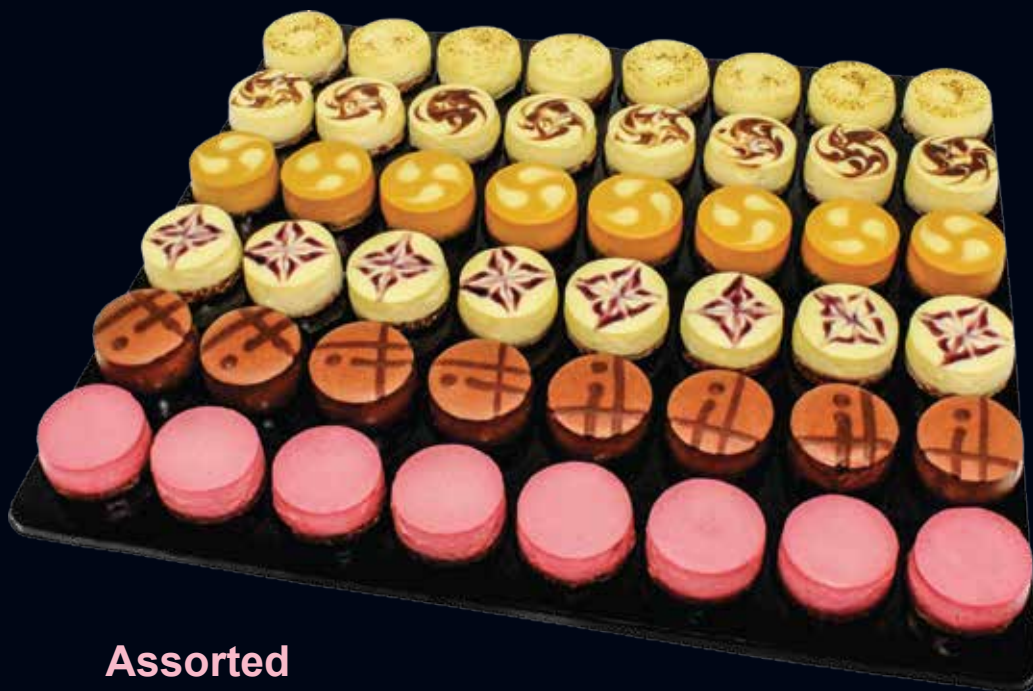
Assorted “Petit Cheese Cakes” 48 pcs/tray